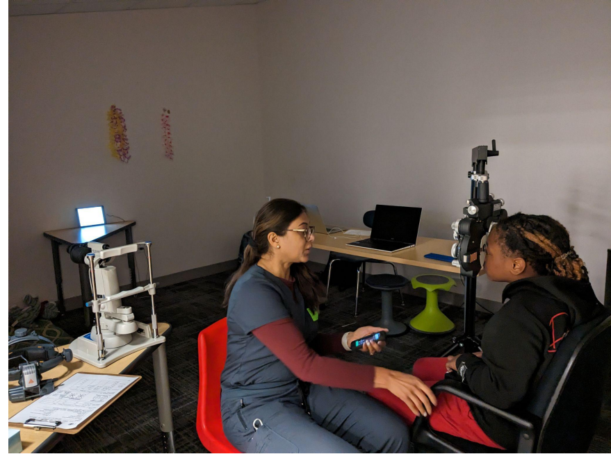
An eye doctor provides an eye exam to an AFIA student onsite.