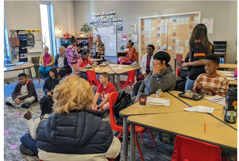
Families joined morning meeting after Grandparent's Breakfast.